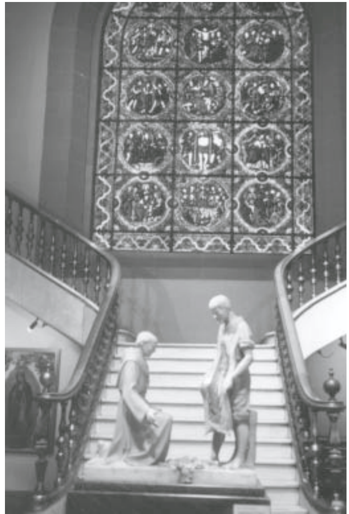
Museo de Basilica de Guadalupe

Museo de Basilica de Guadalupe – This museum, housed in the old Basilica, contains thousands of priceless church artworks, many of them reflecting the story of Our Lady of Guadalupe. The entrance hall is lined with hundreds of tiles decorated by pilgrims, each detailing Our Lady's saving intervention in their lives.