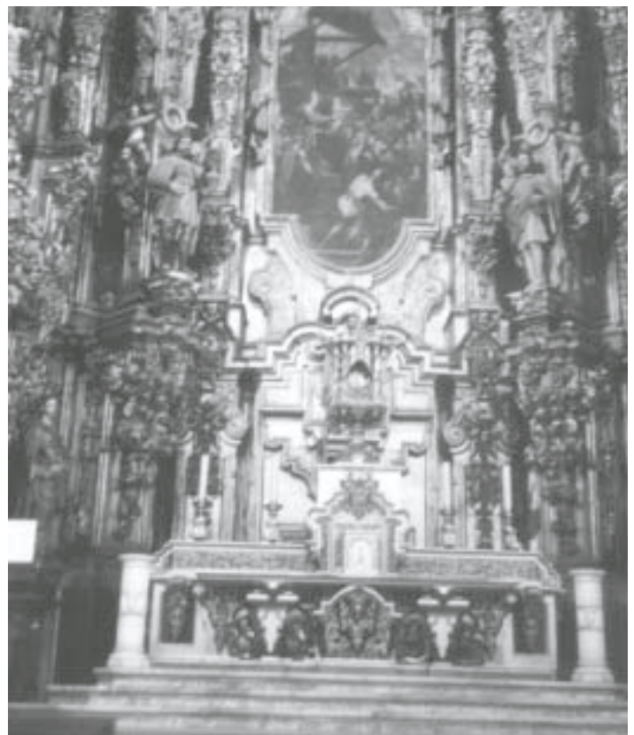
The beautiful gold-leaf altar at the Metropolitan Cathedral

Catedral Metropolitana – The biggest church in Latin America, Mexico City’s cathedral is also at the heart of the world’s largest Catholic diocese. It took almost three centuries to complete. This is reflected in the multiple styles of its architecture and internal decoration, ranging from Classical through Baroque and Churrigueresque to Neo-Classical.