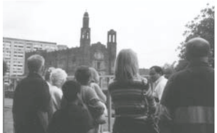
Pilgrims tour the Plaza of the Three Cultures including St. Juan Diego's baptismal church, Santiago de Tlalteloco.

The group was shown the house and property owned by the Guild. The location is ideal, nestled at the base of Tepeyac Hill and adjoining the Baptistery office building, just down Allende Street from a residence for priests. The