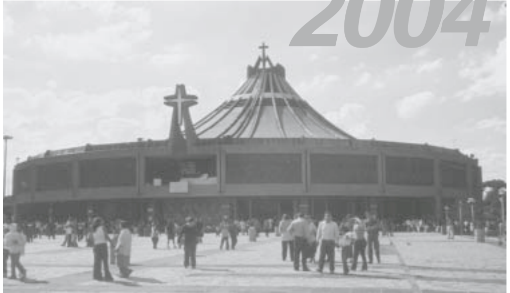
The Basilica of Our Lady of Guadalupe

Walk to the top of Tepeyac Hill where Our Lady appeared to St. Juan Diego, then enjoy a box lunch.