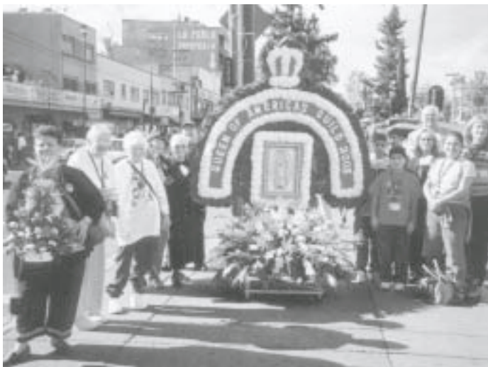
Pilgrims process to the Basilica with the Guild's floral offering.