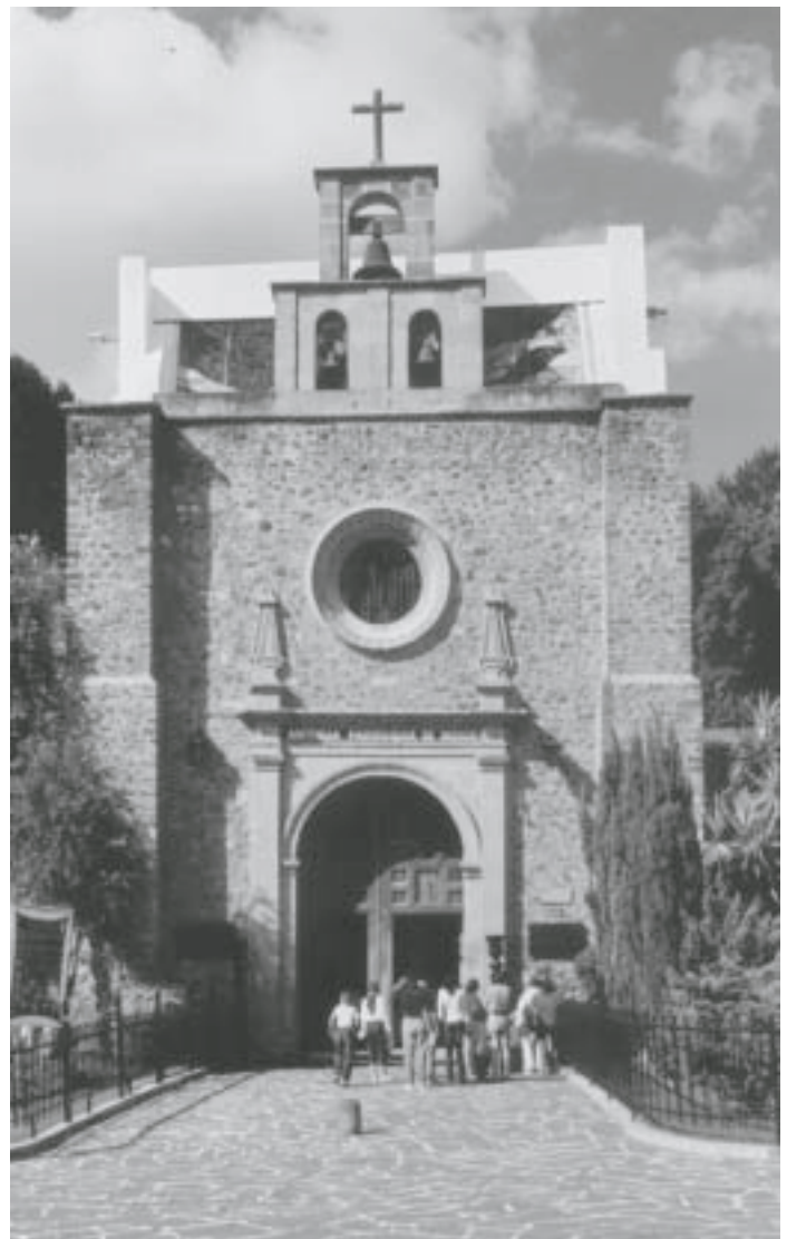
The Church of the Indians

After breakfast and closing remarks by group and spiritual leaders, transfer to the Benito Juarez International Airport for the flight home. (B)