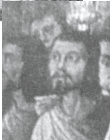
The image of Juan Diego reflected in the eye of Our Lady of Guadalupe similar to an early painting of the seer.

"At the time when Juan Diego presented the bishop with the flowers, Our Lady was actually present in the room, but chose to remain invisible. Instead, in order to give a visible, lasting indication of her presence, she chose to