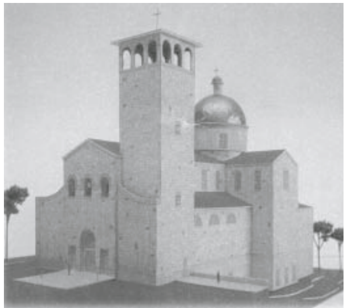
Proposed Shrine of Our Lady of Guadalupe, LaCrosse, WI.