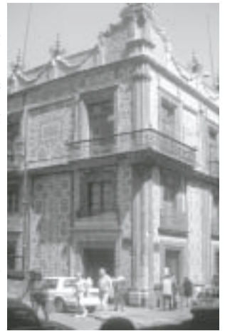
Casa de los Azulejos

Occupied by a fortress since the days of the Aztec, the present palace was built in the 1780’s. During the French Occupation of the 1860s, Empress Carlotta sat in bed to watch her husband, Maximilian, proceed down Reforma on his way to work. Later this was the official home of Mexico’s president until 1939. Now the castle houses a variety of historical artifacts covering the period between 1521 and 1917.