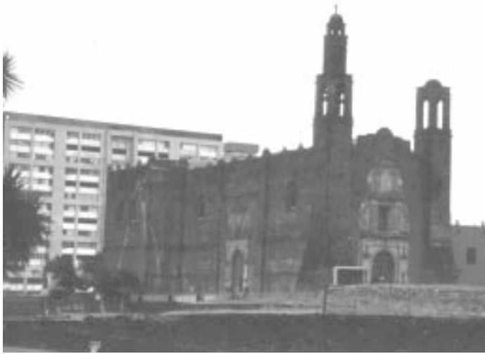
Plaza of The Three Cultures

Plaza de las Tres Culturas – The Plaza of the Three Cultures includes the remains of the Aztec city of Tlateloco, site of the last battle in the conquest of Mexico. Off to one side is the Church of Santiago where St. Juan Diego was baptized and later in life walked 14 miles each Saturday to attend mass and receive Holy Communion.