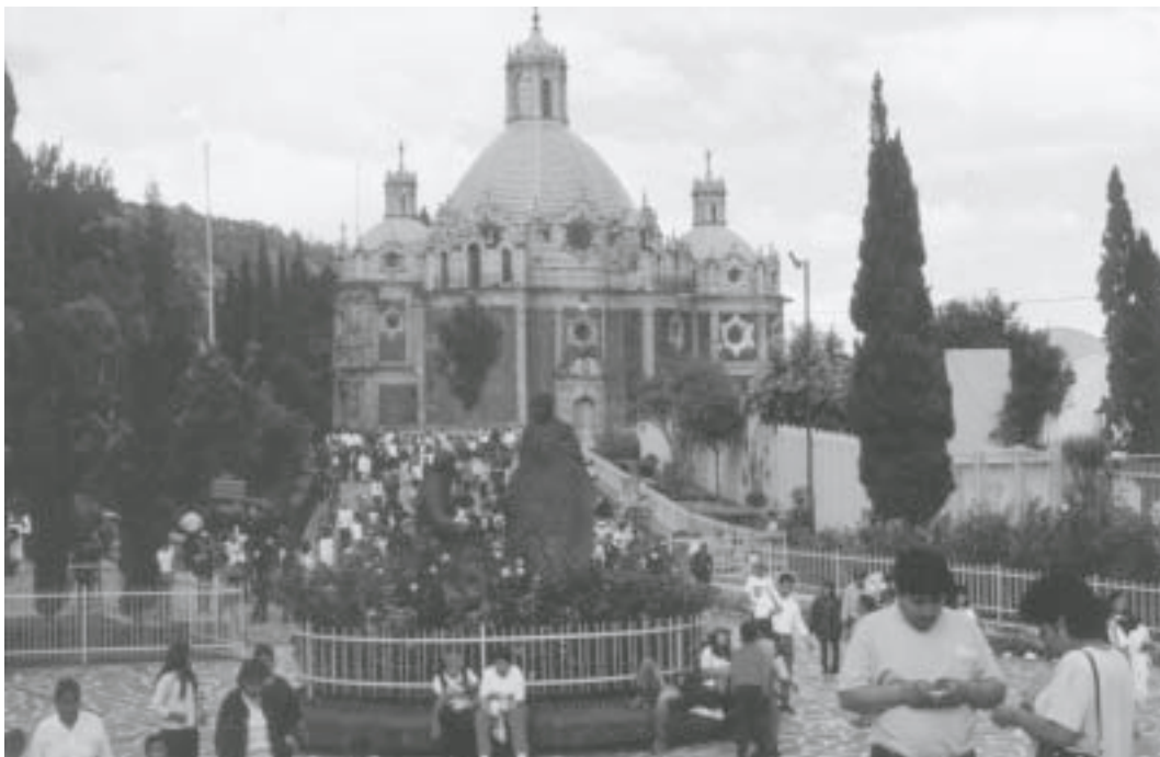
The Church of the Well

Tour the Guadalupe Museum and the remainder of the Basilica grounds. View the retreat center property. Return to the hotel for dinner, stopping on the way at the new St. Juan Diego Chapel. (B/L/D)