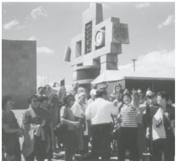
Pilgrims receive an in-depth tour of the entire Basilica area.