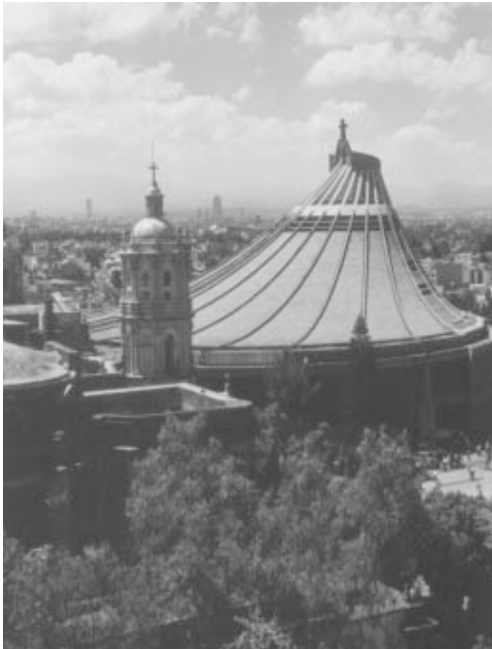
A view of the Basilica from the top of Tepeyac hill

After lunch, tour the Plaza of the Three Cultures and visit the Church of Santiago de Tlalteloco where St. Juan Diego was baptized and where he was headed when Our Lady appeared to him.