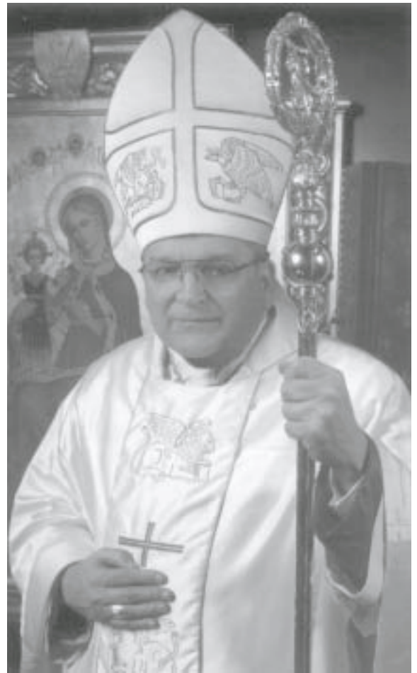
Raymond Leo Burke, Archbishop of St. Louis

In December, 2003, Bishop Burke was named Archbishop of St. Louis.