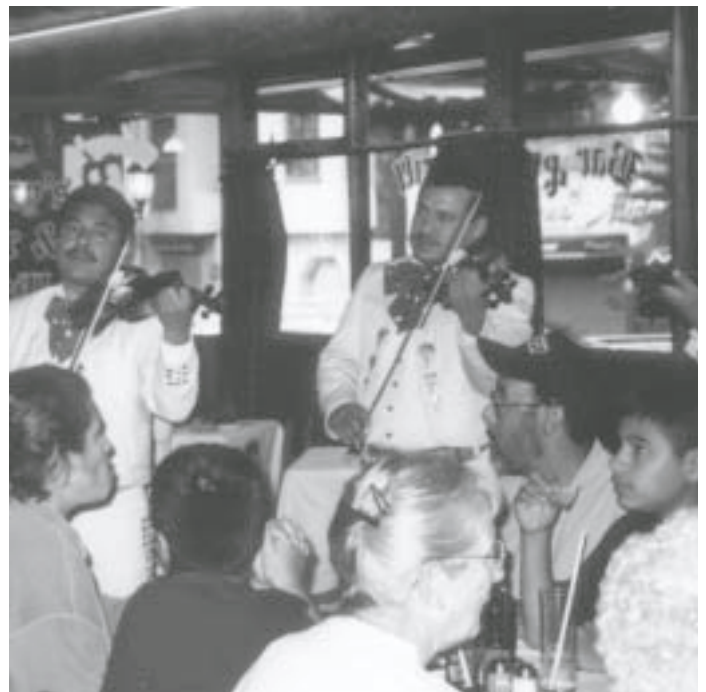
Pilgrims enjoy a sample of Mexican culture at the performance of a talented Mariachi group.

After a full day spent with Our Lady, pilgrims enjoyed dinner at the hotel, along with lively conversation regarding the day's events.